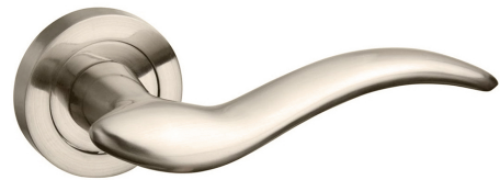
Product Finish Pictured: Satin Nickel